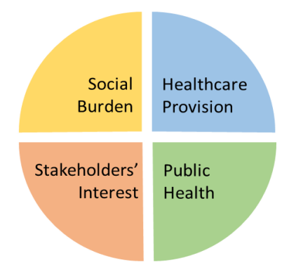
Figure 2. Prioritisation domains

The prioritisation criteria comprise four domains: Social Burden, Stakeholders' Interest, Healthcare provision and Public Health (See Figure 2. Prioritisation domains), and fourteen items. The prioritisation criteria are listed and described herein: